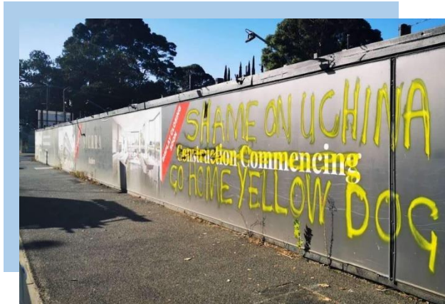
Image 1 Graffiti containing hate speech in Australia, "Shame on you, China!" "go home, yellow dogs!" 1 :

For example, the OK sign displayed by hand (👌) became a hate symbol in the United States in 2019, as far-right groups on the Internet used it to symbolize white supremacy. Likewise, the spread of fascist symbols is a clear hate speech for Jews, as is the display of the Gray Wolves sign for Armenians.