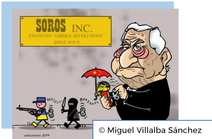
Image 3 An example of a cartoon depicting the conspiracy theories woven around the person of George Soros.

At the core of these woven around the person of George Soros, an American businessman of Hungarian origin, is a conspiracy theory - an unsubstantiated, unproven theory about a big conspiracy. As if Soros wants to destroy Armenian national values and the state, and the authorities elected after the revolution in 2018, as well as the civil society, are financed and controlled by Soros to carry out this conspiracy.