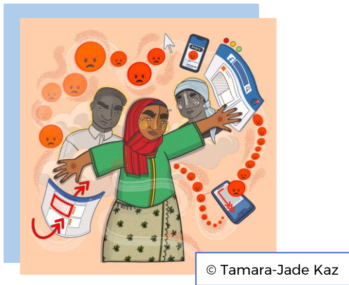
Image 2 A poster from Amnesty International's report showing Facebook's culpability in the genocide against the Rohingya people

In 2021, the representatives of the Rohingya community, who survived mass violence, applied to the court, demanding compensation of 150 billion dollars from Meta.